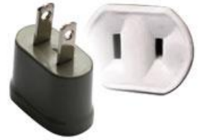
Type A plug and outlet

Electricity: Standard power supply in Japan is 100 V. The frequency is 50 Hz in eastern Japan including Tokyo. The type of power outlet/connector used in Japan is A type which is a two-parallel-pronged type. Please ensure you bring the correct adapter for your equipment.